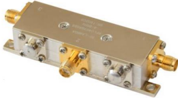
Photo is for illustration purpose only Please refer to outline drawing