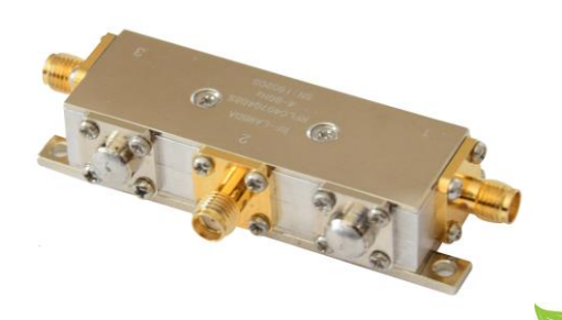
Photo is for illustration purpose only Please refer to outline drawing